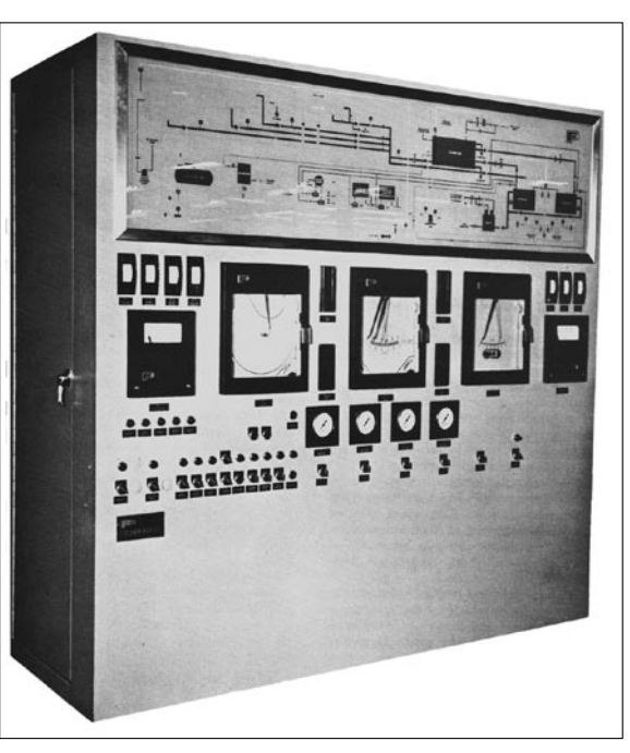
Figure 4. Installed at the New Hyde Park Municipal Pool, in Hyde Park, New York, this late 1960s system automatically monitored and controlled chlorination, alkalinity, filtering, and water levels.

chlorine product contains 13 g of NaOH per liter. This may or may not be a good thing. Sometimes this negates the need to add alkalinity-increasing chemicals to the water, but when the water is already alkaline, the pH may become unacceptably high (38). Because it is a liquid this product is easier to handle. It can be automatically fed into the water or simply poured in by hand. It does deteriorate in sunlight and warm temperatures, which are of course exactly the conditions where pools receive the most use. The other major drawback is that sodium hypochlorite cannot be used with hard water since it leaves calcium deposits. When these clog the automated feeders, a rinse with hydrochloric acid is necessary to clear them (37).