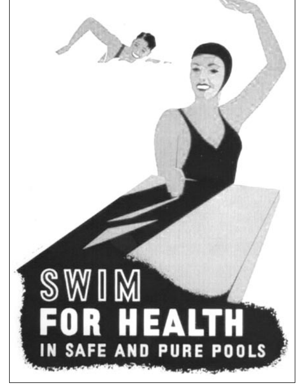
Figure 3. WPA Poster titled "Swim for health in safe and pure pools," Library of Congress.

A survey of high school pools in 1930 revealed that most used "Chlorine" or "chlorine in one of its forms" for sterilization. The results of the survey are listed in Table I (10). The pool manager of the 1930s not only had to contend with the issues of chlorine levels, alkalinity, and water clarity, but the state of swimwear. In 1937, the pioneering women's physical education promoter, Mabel Lee, offered a number of suggestions. Because wool bathing suits tended to shed lint that clogged filters and the fabric dyes came off in the water, a standardized "ugly, gray-cotton uniform" was preferred for collegiate swimming. Lee wrote that in the 1930s treated wools and less soluble dyes made suits available in "Gay colors, pleasing styles, and materials that hold their shape". Even so,